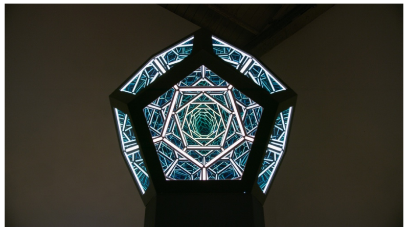
(Opera Gallery: Anthony James, 50" Icosahedron, 50" X 50" X 50")

experimentation with light and space. The Birch Series of sculptures debuted in New York City in 2005 and consists of several variously sized, freestanding and wall mounted, internally illuminated, steel and glass vitrines with birch tree trunks inside. The Portal sculptures, made of titanium, LED lights and specialized glass explore concepts of the universal and transcendental.