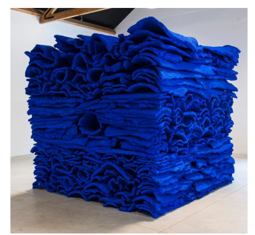
(Galerie Forsblom, Jason Martin, Ultramarine Blue Cork Stack, 2013)

• Galerie Forsblom will debut a statement sculpture piece by British artist Jason Martin. Martin's work has been exhibited widely both in the US and Europe at venues including Schauwerk Sindelfingen Museum in Germany in 2017, the Peggy Guggenheim Collection in Venice in 2009, and at Centro de Arte Contemporàneo de Malaga in 2008. The matte ultramarine blue cube presentation is a large cork stack sculpture (240 x 300 x 300 cm / 94 x 118 x 118 inches) and will greet each visitor of Art Miami as they enter the fair.